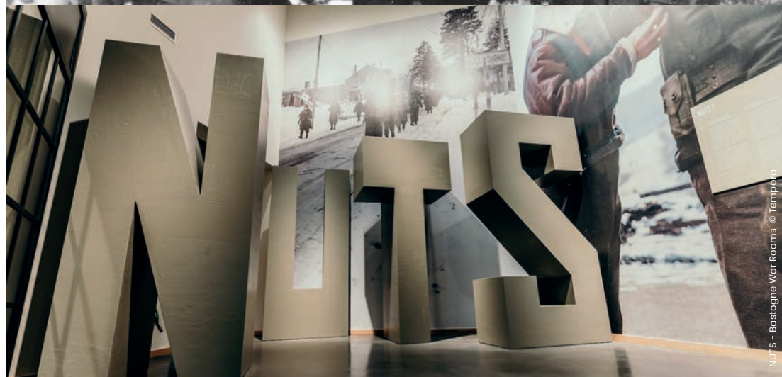
NUTS - Bastogne War Rooms