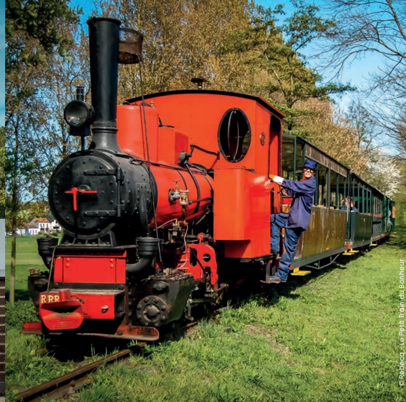
© Rebecq - Le Petit Train du Bonheur