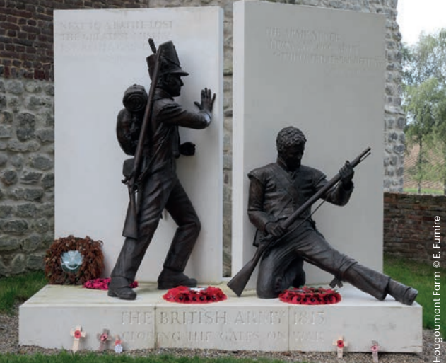
Hougoumont farm