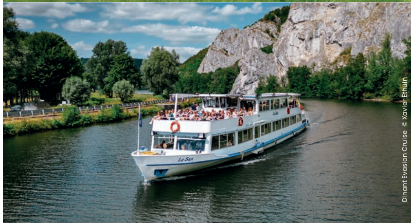
Dinant Evasion Cruise