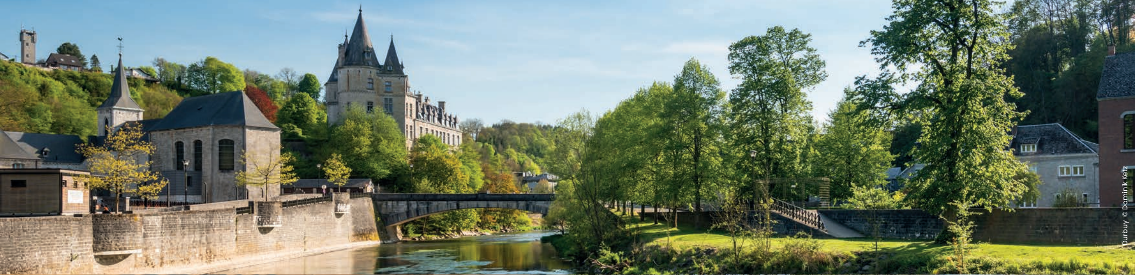
Durbuy