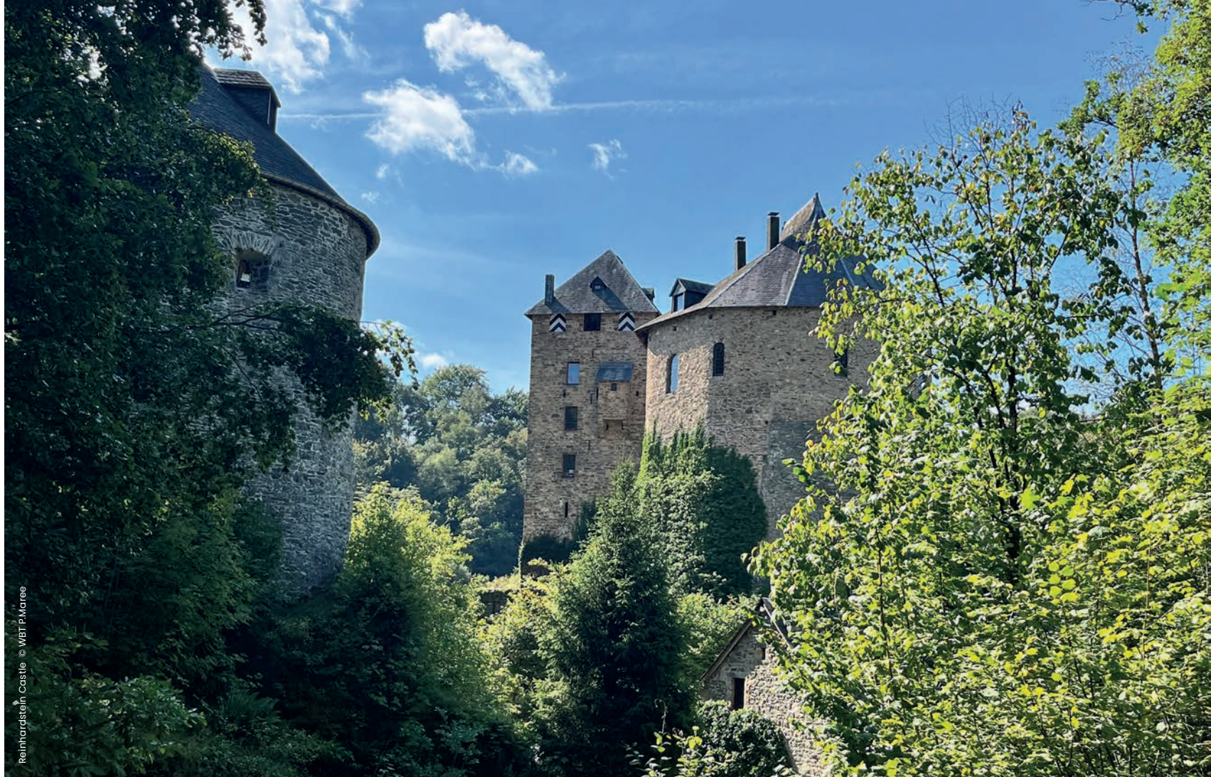
Reinhardstein Castle

The castle has been through the mill since it was first built in 1354. Sitting on a rocky outgroup in the deep gorge of the Warche Valley, it stands in a perfectly restored state today thanks to a man called Professor Overloop. He saved its patrimony in the 1970's by using old 14th century documents to successfully reconstruct towers and parapet walks with stunning results. A guided tour in English (on request) will guide you through the castle's fabulous tapestry and weapons collection. Treat yourself to the castle's very own Reinhardstein amber beer or soft cheese. All collectively reflecting the tastes and passions of the last masters of the land. www.reinhardstein.net