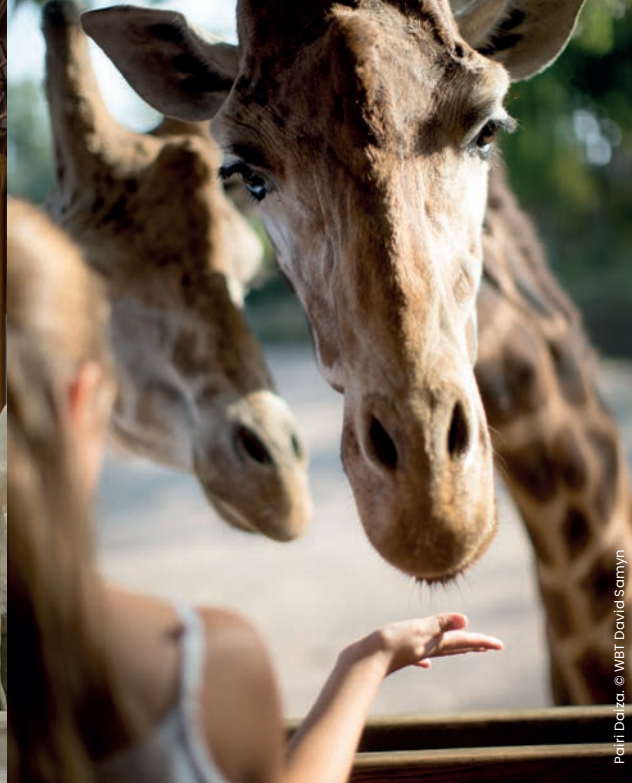
Pari Daiza.