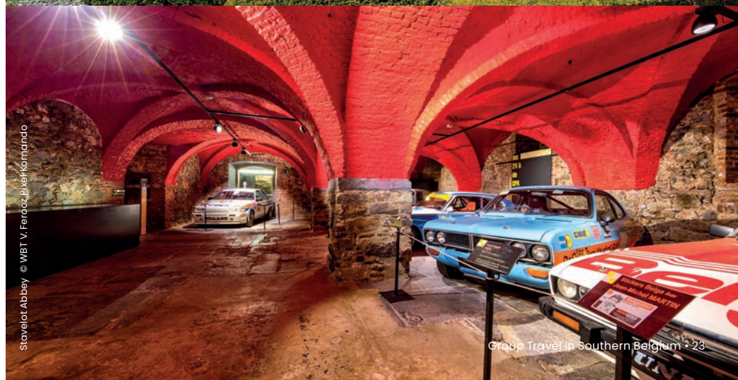
Stavelot Abbey