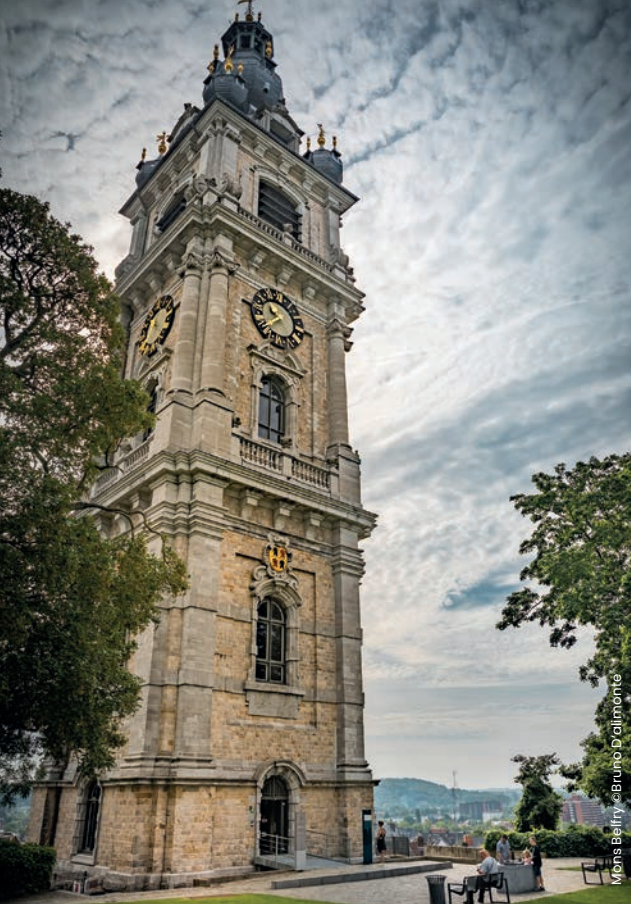
Mons Belry