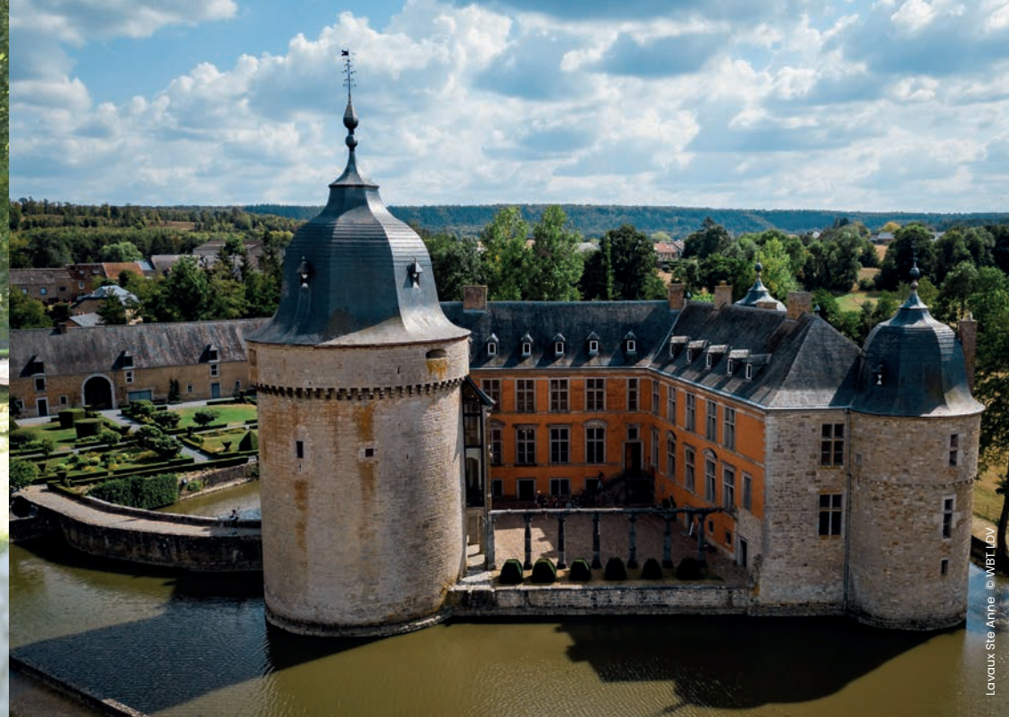
Lavaux Ste Anne

Much more than an ancient abbey, it also houses a microbrewery, a hops farm and a cheese museum. Groups can book tasting tours around the state-of-the-art brewing facilities, concluding in the Chapelle room for a beer and cheese tasting. The guide will show you around the abbey, the cemetery, the monks' garden, the ceramics workshop. Groups can take time to stroll around the grounds and feel the peace and calm of the gardens. www.tourisme-maredsous.be