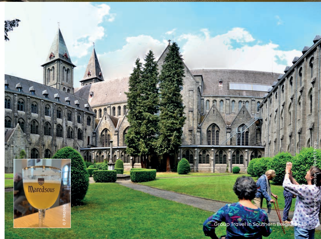
Maredsous Abbey