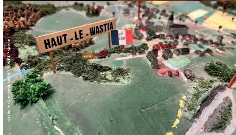
Musée du Souvenir Mai 40