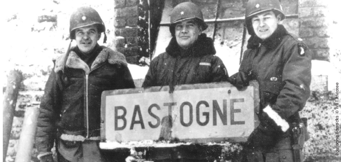
Bastogne Barracks

If your group is game for enhancing the history lesson with a little more exertion, then Bouillon's feudal castle will hit the spot. Dating from 988AD it's associated with Crusader Knight Godefroid de Bouillon, the first 'Belgian' ruler of Jerusalem. It has an impressive labyrinth of stairs, narrow corridors, vast vaulted rooms and secret chambers. And if you climb its steps to access Austria Tower, the highest point of the castle, you'll be rewarded a striking panoramic view over the town, the Semois valley and the Ardennes forests. www.chateaubouillon.com