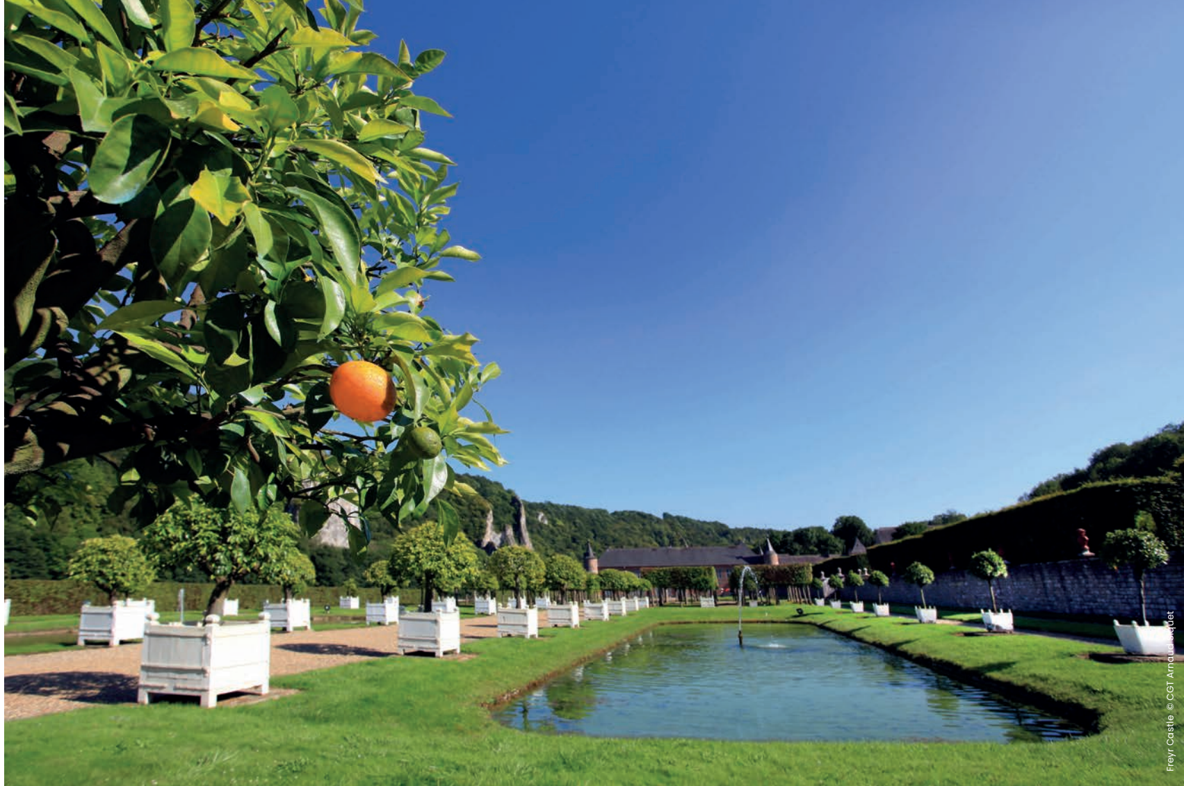
Freÿr Castle

For a memorable visit, groups can take a mini cruise from Dinant and get off to explore the castle. www.freyr.be