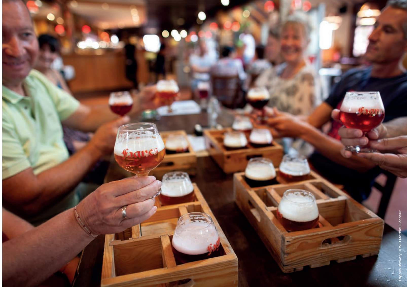
Fagnes Brewery

The German surge through the Ardennes and eastern Belgium in May 1940 was truly astonishing. The museum commemorating the Battle of the Meuse (12-15 May 1940) is in the village of Haut-le-Wastia, on a wooded bluff high above the Meuse and close to Dinant. www.museedusouvenirmai40.be