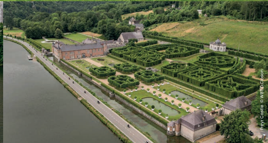
Freÿr Castle