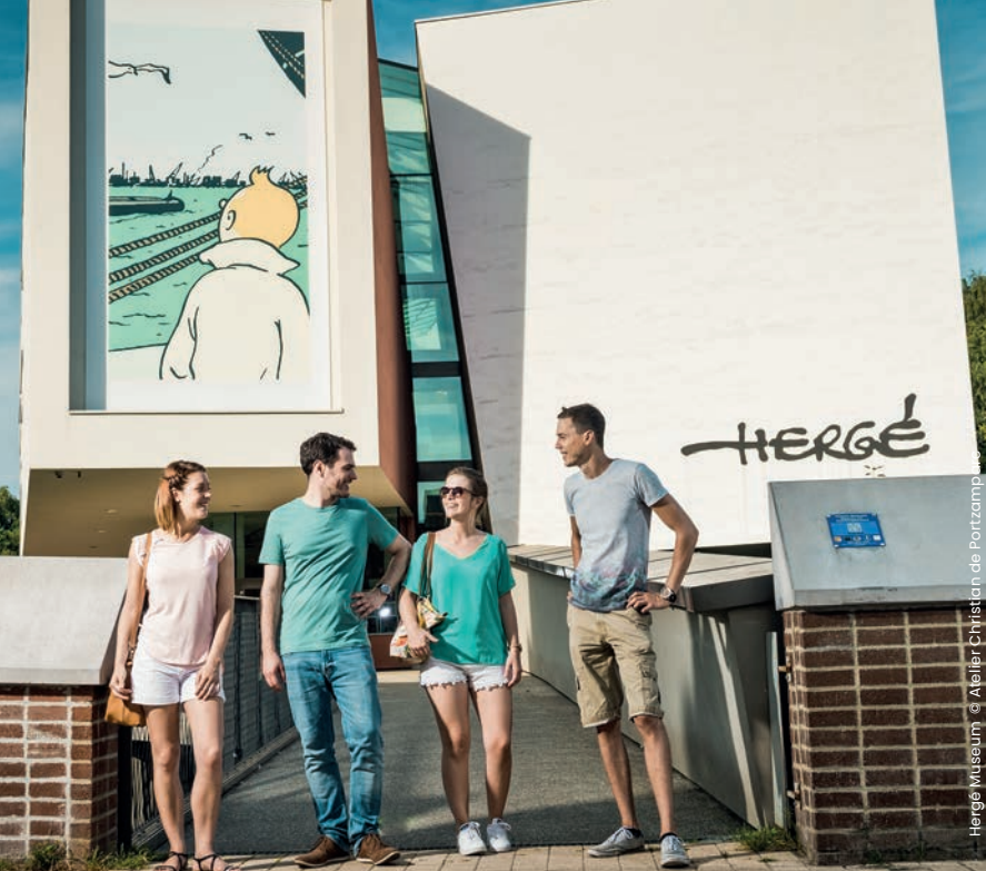
Hergé Museum © Atelier Christian de Portzamparc