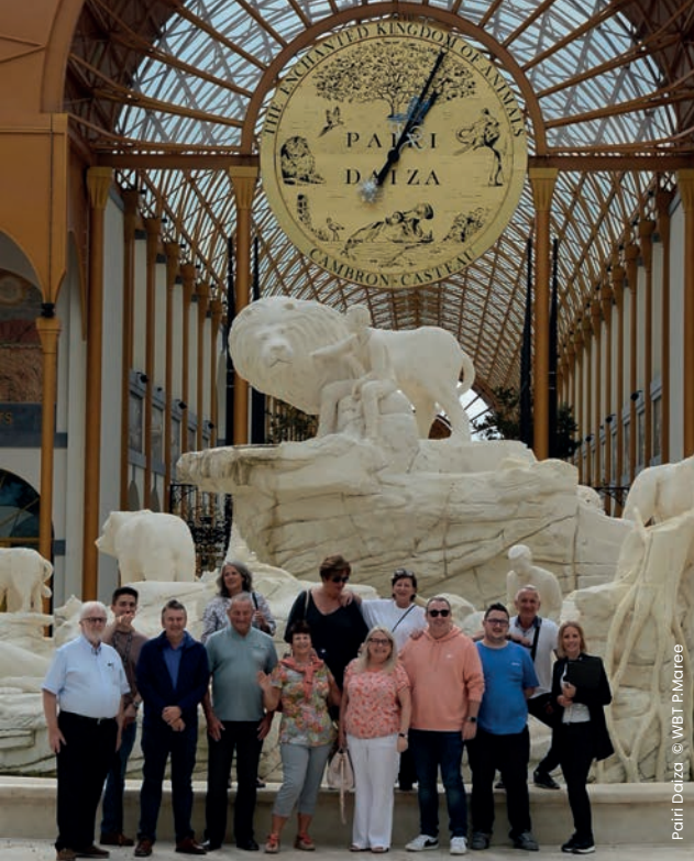
Pari Daiza.