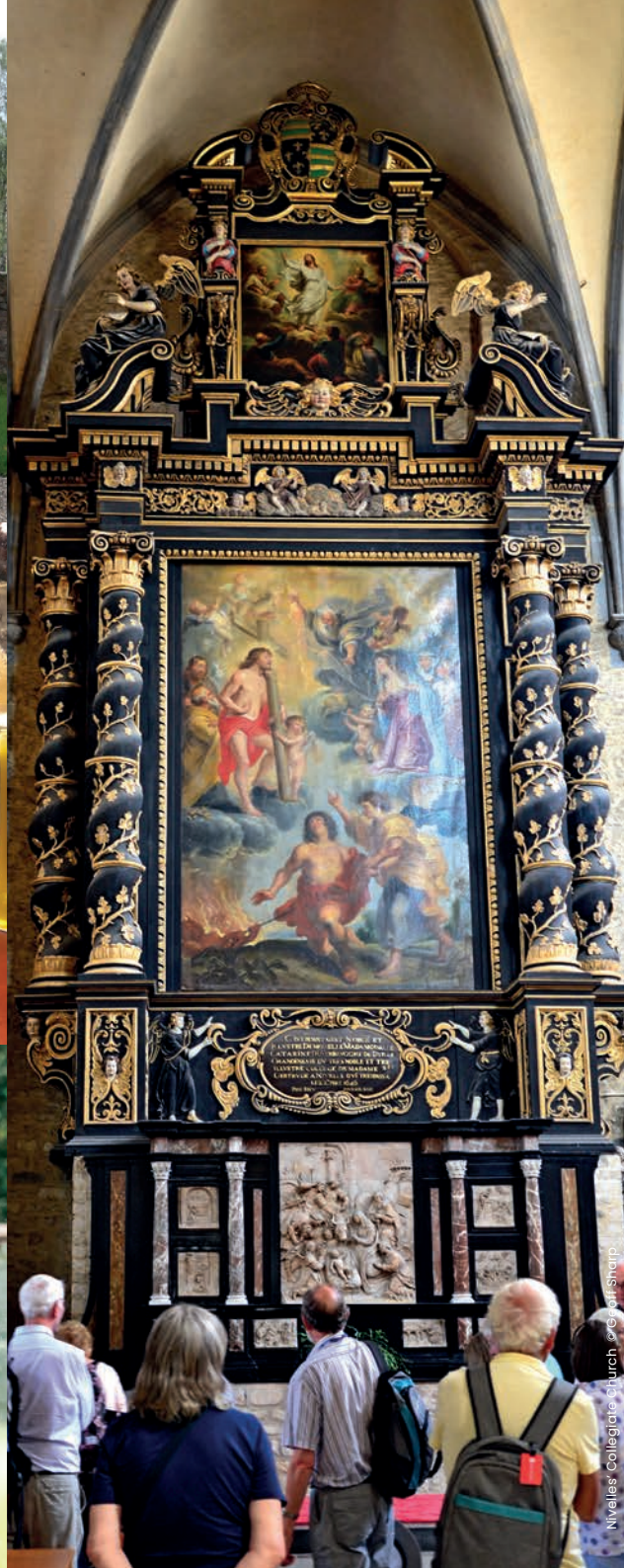
Nivelles' Collegiate Church